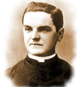
Venerable Father Michael J. McGivney